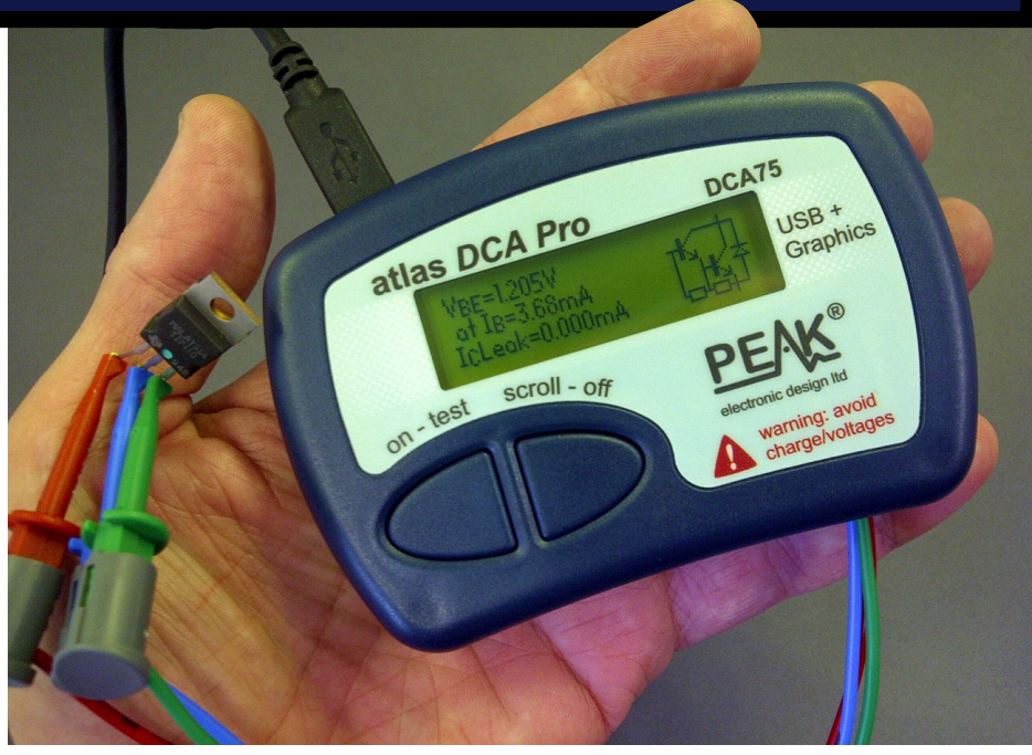
Detailed component information on your PC, complete with curve tracing functions.